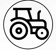
Tractors - 4