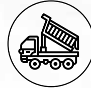
Tipplers - 4