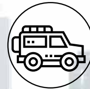
Bolero - 4