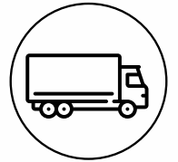
2 Ton trucks - 4