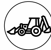
JCB (Proclainer) - 2