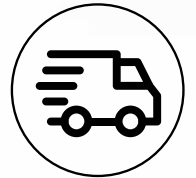
DCM van - 2